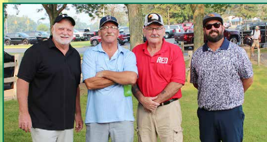
1st PLACE TEAM

See Pages 5 & 6 for more Golf Outing Photos