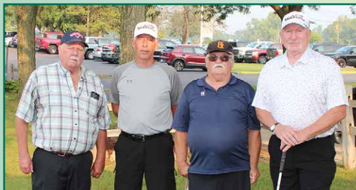
2nd PLACE TEAM