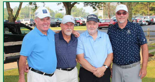
3rd PLACE TEAM